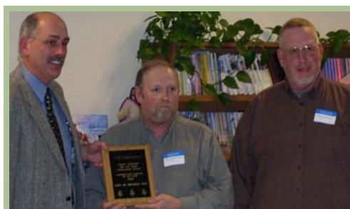
2004 Conservation Partner City of Presque Isle Public Works Dept.