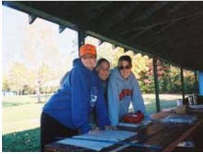
Kennedy Brook Girl Scout Stream Team.