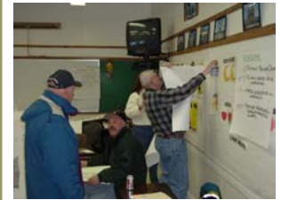
Steering committee session for the Prestile Steam Watershed Management Plan.