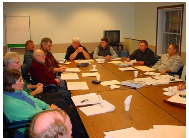
Monthly meeting of the CASWCD at the USDA Service Center conference room on the Fort Fairfield Road.